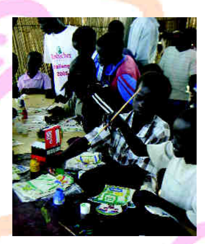
Sudanese boys painting colorful puppets for a german group.