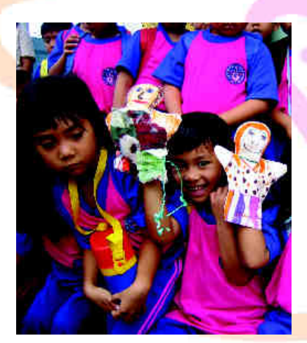
Girls in Bolivia with their Wichtelpuppets. They got them in Sunday school.